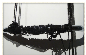
Sheela Gowda Behold (detail) 2009 hair and steel dimensions variable photograph: Christoph Storz © the artist